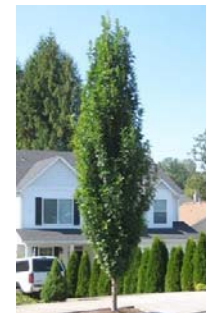
#15 Regal Prince Oak (Reg. $109.99)

Limited to stock on hand. Selection runs through November 14th.