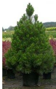
#15 Austrian Pine (Reg. $109.99)