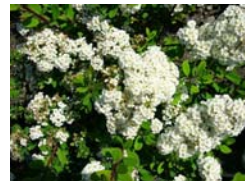
#5 'Snowmound' Spiraea (Reg. $28)