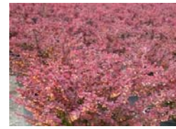
#5 'Rose Glow' Barberry (Reg. $26.99)