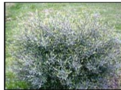
#5 'Dwarf Arctic' Willow (Reg. $26.99)