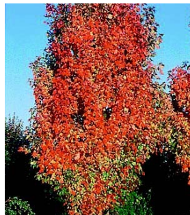
#15 'Bowhall' Red Maple (Reg. $119.99)