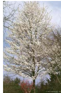
#15 Chanticleer Flowering Pear (Reg. $109.99)