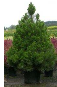
#15 Austrian Pine (Reg. $109.99)

Limited to stock on hand. Selection runs through December 15th.