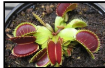
A Venus Fly Trap With Good Coloration

Full direct sunlight for a least 4 hours per day. Water with “pure water” - distilled, rain or water with a low concentration of mineral content. Plant should remain moist, not soggy or too dry. Use a soil mix of nutrient poor medium like Unigro Cactus Mix. Never fertilize your Venus Fly Trap.