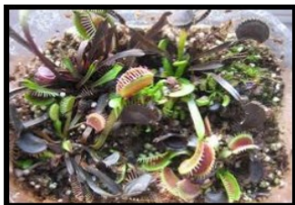
A Venus Fly Trap Entering Dormancy

The plant must go dormant for 3-5 months each year to insure that it stays happy and healthy. In the fall it will start shedding its summer leaves and growth will slow as temperatures drop. It will put out smaller, lower, ground hugging leaves as the existing leaves start to turn black. Your plant is not dying: it's just telling you it's going dormant.