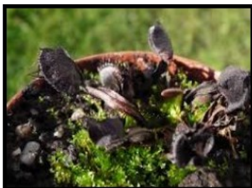
Dried and Dead Venus Fly Trap