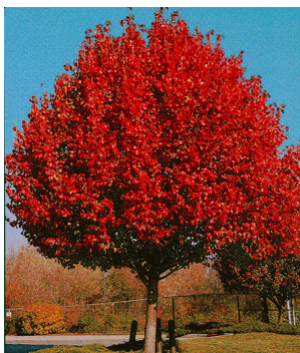
'Autumn Blaze' Flowering Pear

For more information about Animal Ark click here.