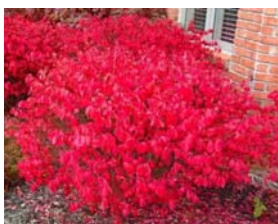
#5 Burning Bush (Reg. $29.99)