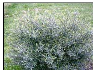
#5 Dwarf Arctic Willow (Reg. $28)

Buy 3 or more trees - For $55 each! (we are still planting - until the ground is frozen)