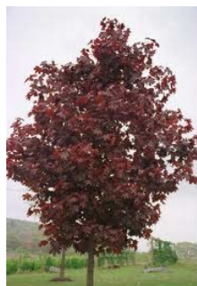
#15 'Crimson King' Norway Maple (Reg. $109.99)

Buy 3 or more trees - For $55 each! (we are still planting - until the ground is frozen)