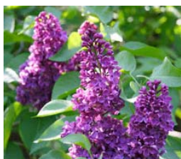
#5 Purple (Common) Lilac (Reg. $29.99)