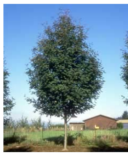
#15 'Cardinal Royal' Mountain Ash (Reg. $109.99)