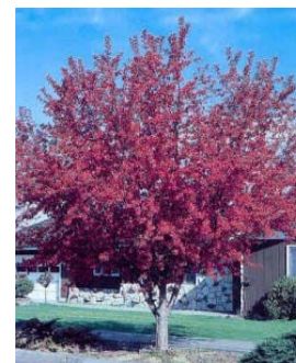
#15 'Brandywine' Flowering Crabapple (Reg. $119.99)

Limited to stock on hand. Selection runs through January 31st