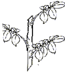
Cut to five-leaflet leaf