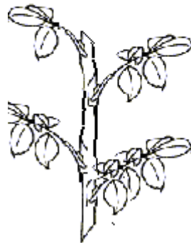
Cut to three-leaflet leaf