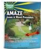
Amaze Weed Control