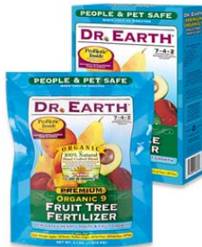
Dr. Earth Fruit Tree Fertilizer