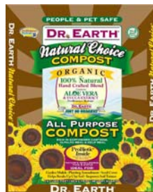
Dr. Earth Compost