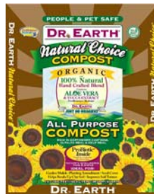
Dr. Earth Compost