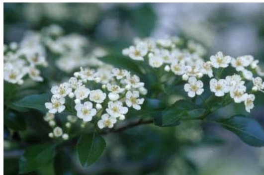
'Crusader' Thornless Hawthorne

tolerant when established. Small specimen with four seasons of interest; is great for small yards. Handles exposure, wind, heat and cold.