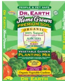
Dr Earth Vegetable Planting Mix