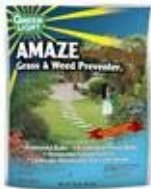
Amaze Weed Control