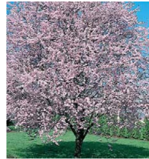
'KV' Flowering Plum