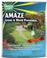
Amaze Weed Control